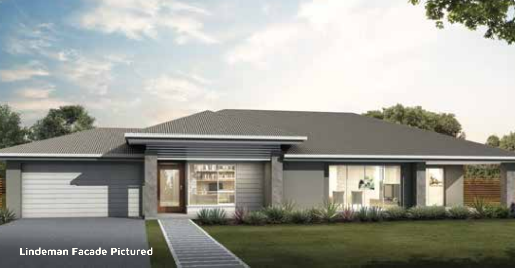
Lindeman Facade Pictured